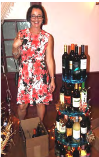
The winner of our giant wine tower raffle—enjoy!

Ted's Package Store, Southbridge Savings Bank, Forensic Risk Alliance, TD Bank Interior Resources, Wayside Youth & Family Support Network, Ogletree & Deakins, Oliver Wight Tavern, Sturbridge Cheese & Chocolate, Paoletti's of Charlton, Publick House Historic Inn