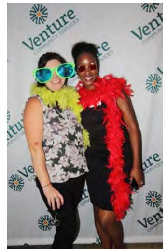
The Venture photo booth was the fun stop of the night.

Additional photos from the event can be viewed through the Venture Flickr page