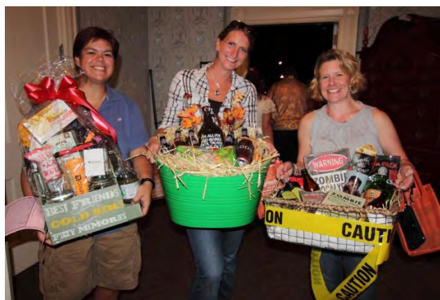
Happy supporters of the silent auction.

Additional photos from the event can be viewed through the Venture Flickr page