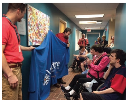
Unveiling ceremony – September, 2016