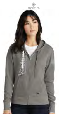
Ladies Thermal Grey or black