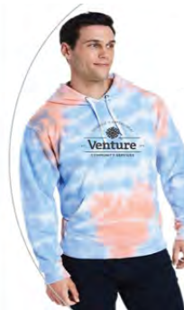
tie dye (J.America)