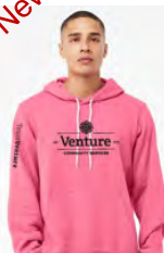
Hthr charity pink