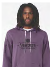
Hthr team purple